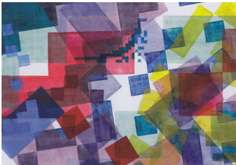
Fig.4: BridA: The City Of Ljubljana , 2010

[O]nly when one produces images of calculations instead of facts (it does not matter how "abstract" the facts) can "pure aesthetics" (the joy of playing with "pure forms") find its true expression; only then can Homo ludens replace Homo faber . 5