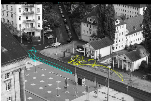
Fig.1: BridA: Trackeds 1.0 , 2009

The concept of BridA's Trackeds 1.0 is to place a camera at a high position and monitor how people or vehicles – like motorbikes, cars or trucks – move about. Those movements are detected and marked by software so that the spectator of the computed animation can see blue or yellow dots, which are connected by bowed, dynamic lines, floating on a screen. At first glance, one expects this system to be a device, which is recording movement to analyze and optimize traffic streams.